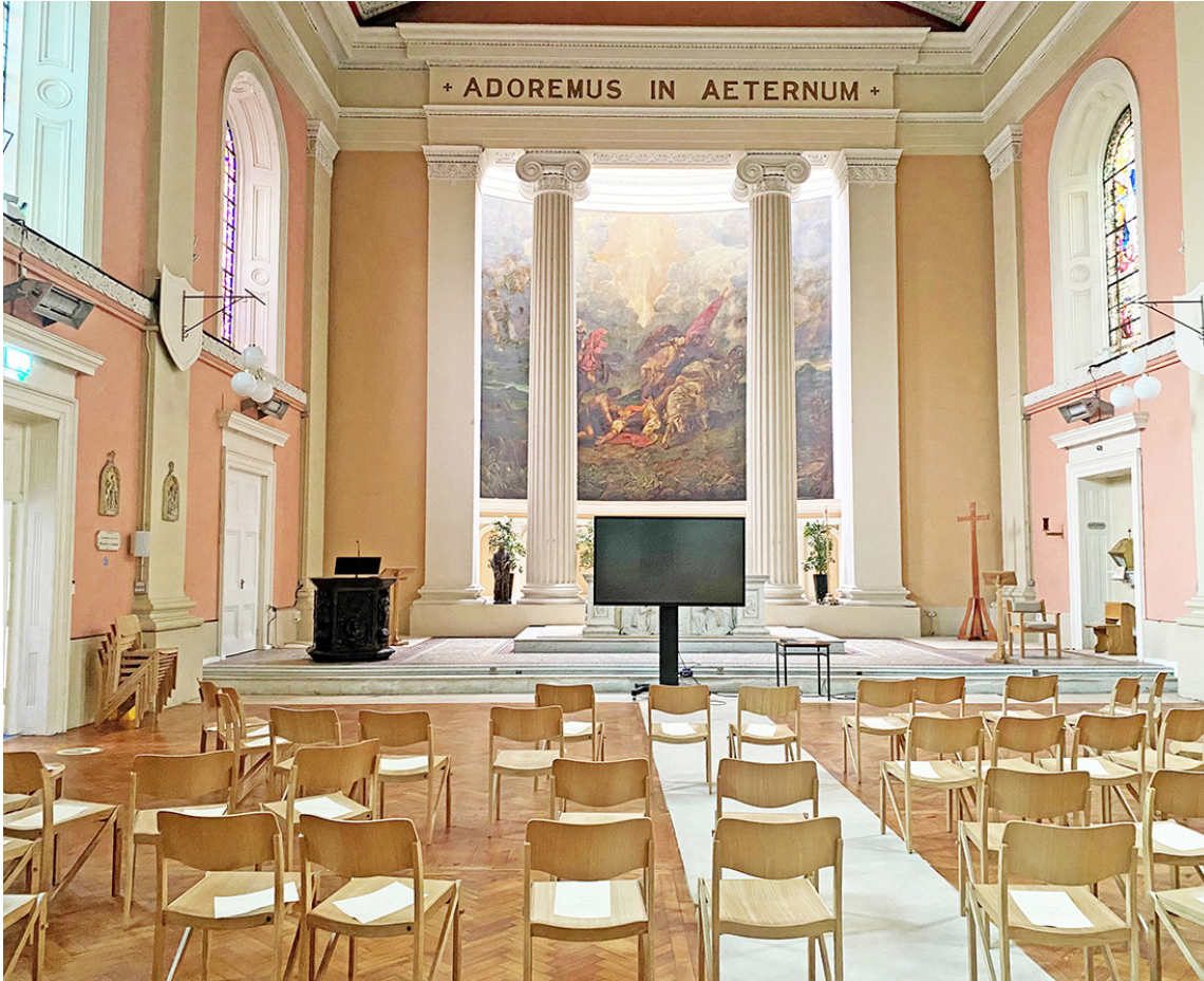
St Paul's Church, Arran Quay, home of the Office of Mission & Ministry; and, below, the 2022 graduates of the Pathways programme, organised by the Office of Mission & Ministry