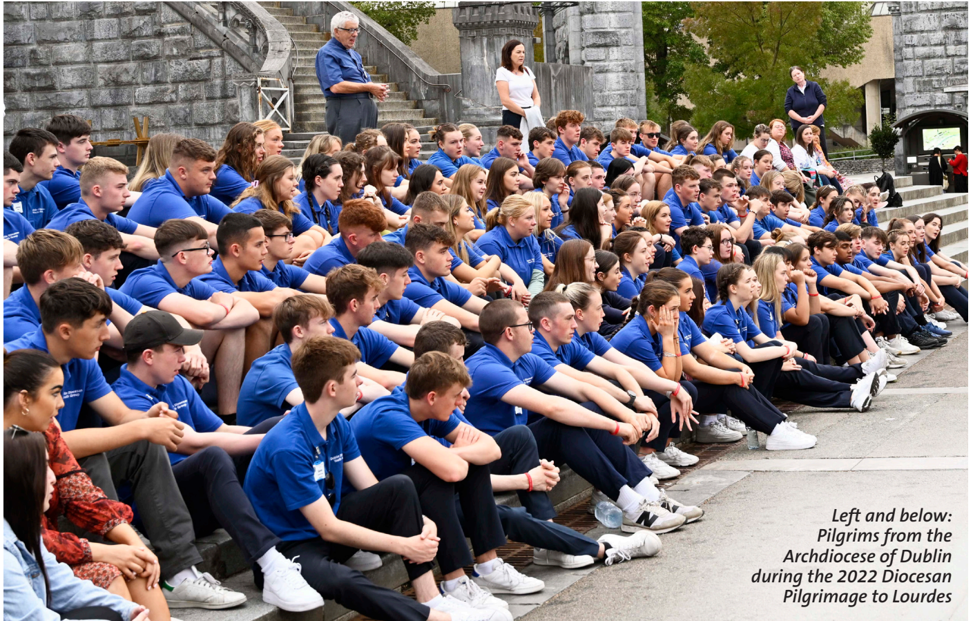
Left and below: Pilgrims from the Archdiocese of Dublin during the 2022 Diocesan Pilgrimage to Lourdes