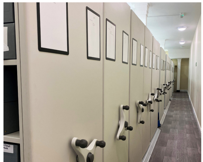
Above: The reading room and storage area. Top of page: Archivist Noelle Dowling with volunteer Peter Sobolewski