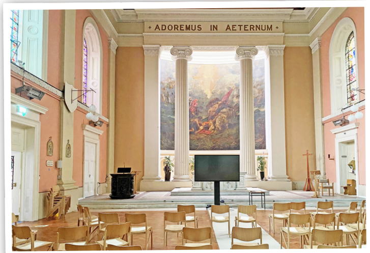
The newly renovated St Paul's Church, Arran Quay